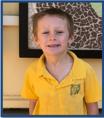
Dane - A pencil sword.