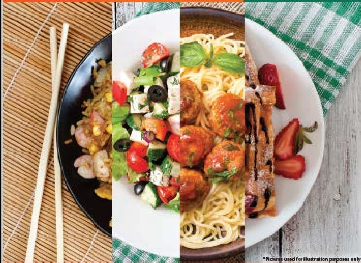
*Photos used for illustration purposes only